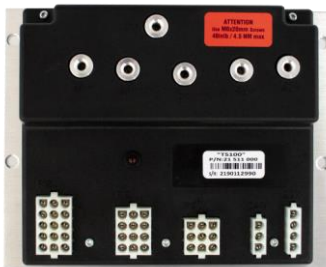
TRIONIC vehicle controls