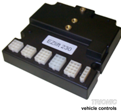
TRIONIC vehicle controls

Optional: Text display module provides end-user status & fault descriptions to minimize down time