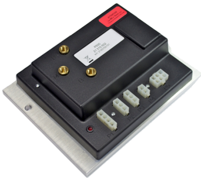
TRIONIC vehicle controls