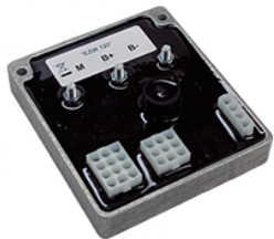
TRIONIC vehicle controls

Total I/O count is 18. Inputs from platform switches (or ground mode emergency switches) control vehicle functions via protected valve & line contactor drivers. Integrated tilt sensor can be configured to limit or prevent selected functions when vehicle is tilted.