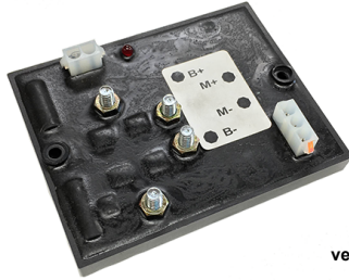
TRIONIC vehicle controls