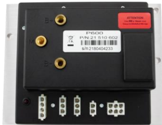
TRIONIC vehicle controls